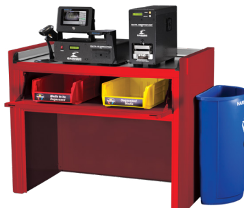
Degauss, Destroy, Recycle Workstation package (DDR-25SSD IRONCLAD)