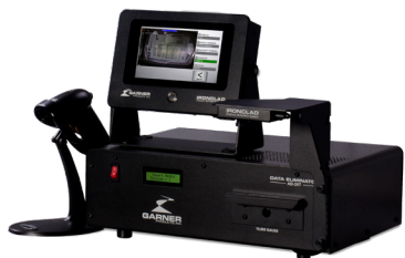
IRONCLAD Erasure Verification System