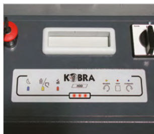
Convenient touch-screen panel with LED Feeding Control System.

The KOBRA HDD produces very low noise levels on a 24 hour continuous duty operation, destroying digital media devices with a shred dimension of 1" 9/16 x random.