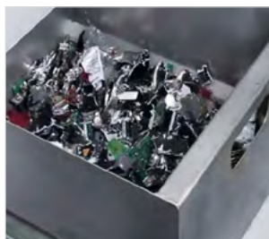
Easy removal and emptying of waste container.